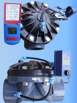
Control Flushing Valve