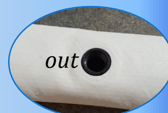
Integral 1/2" female threaded